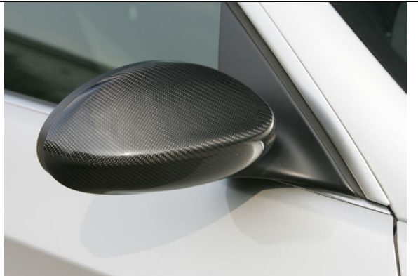
Carbon Fibre mirror covers