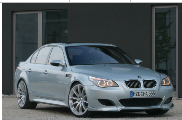
Illustrated above shows the E60 equipped with Hartge wheels, suspension and body equipment.